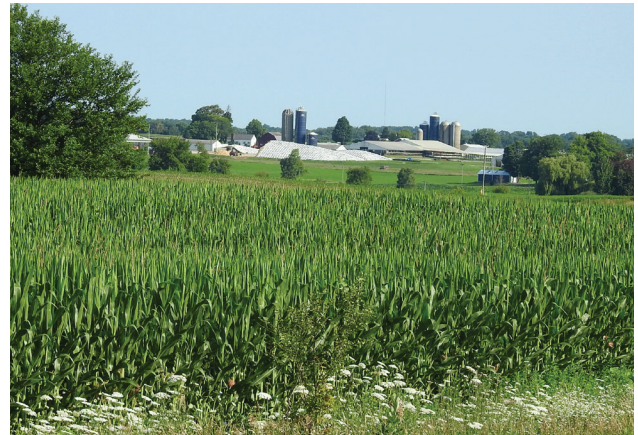
Agricultural activity in the Fremont area

The West Michigan Agri-Cluster Coalition recently hosted its third meeting to coordinate regional strategies for addressing challenges across the region’s agricultural industry. Identified in the 2025 West Michigan Agriculture Cluster Impact Analysis, constraints in labor, infrastructure, and regulatory landscapes drive the Coalition’s work to foster cooperation and coordination to advance West Michigan’s agricultural cluster.