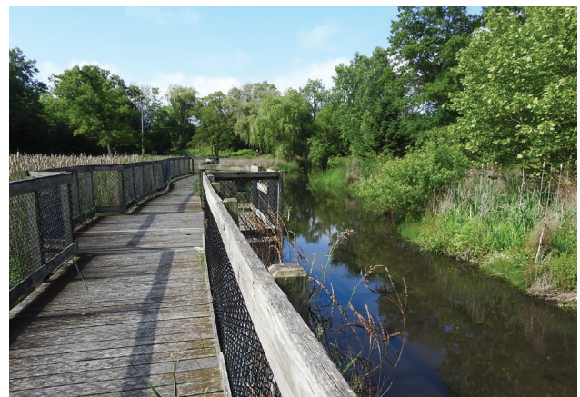
Boardwalk at Johnny O. Harris Memorial Park,

We are excited to announce that WMSRD will be assisting the City of Muskegon Heights with updating its Recreation Plan. The project will begin this spring and is expected to end later this year. This is a unique opportunity where we can leverage DNR Spark Grant funding from the State of Michigan and provide this service at no cost to the community! We look forward to engaging with residents and preparing a plan that will allow the city to apply for recreation grants for five years following completion.