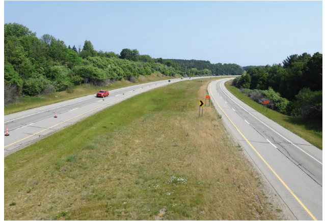
M-120 in Muskegon County

WMSRDC coordinates public and committee meetings, serves as the committee’s fiduciary agency, and develops plans based on input from both the public and committee members. Upcoming committee work includes forming a signage subcommittee and updating the corridor management plan for the Pike.