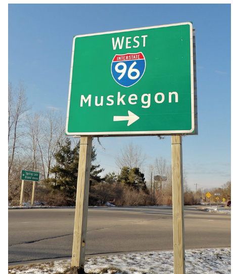
I-96 Entrance ramp in Nunica

Each display features helpful tips on how you can voluntarily reduce emissions, plus free swag like tire gauges, coloring books, frisbees, and stickers. Stop by any of these locations this summer to learn how we can keep West Michigan's air cleaner together!