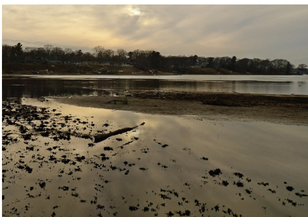
Hidden Cove Park: a coastal waterway in Muskegon County

Under the Michigan Coastal Management Program, WMSRDC is collaborating with EGLE's Water Resources Division for additional environmental resiliency education and project