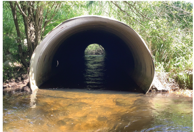
Undersized road stream crossing on Mena Creek, one of the top priority projects for aquatic connectivity; picture credit Trout Unlimited

While a handful of the top projects are being proposed to flow through the next phase of engineering and design under NFWF