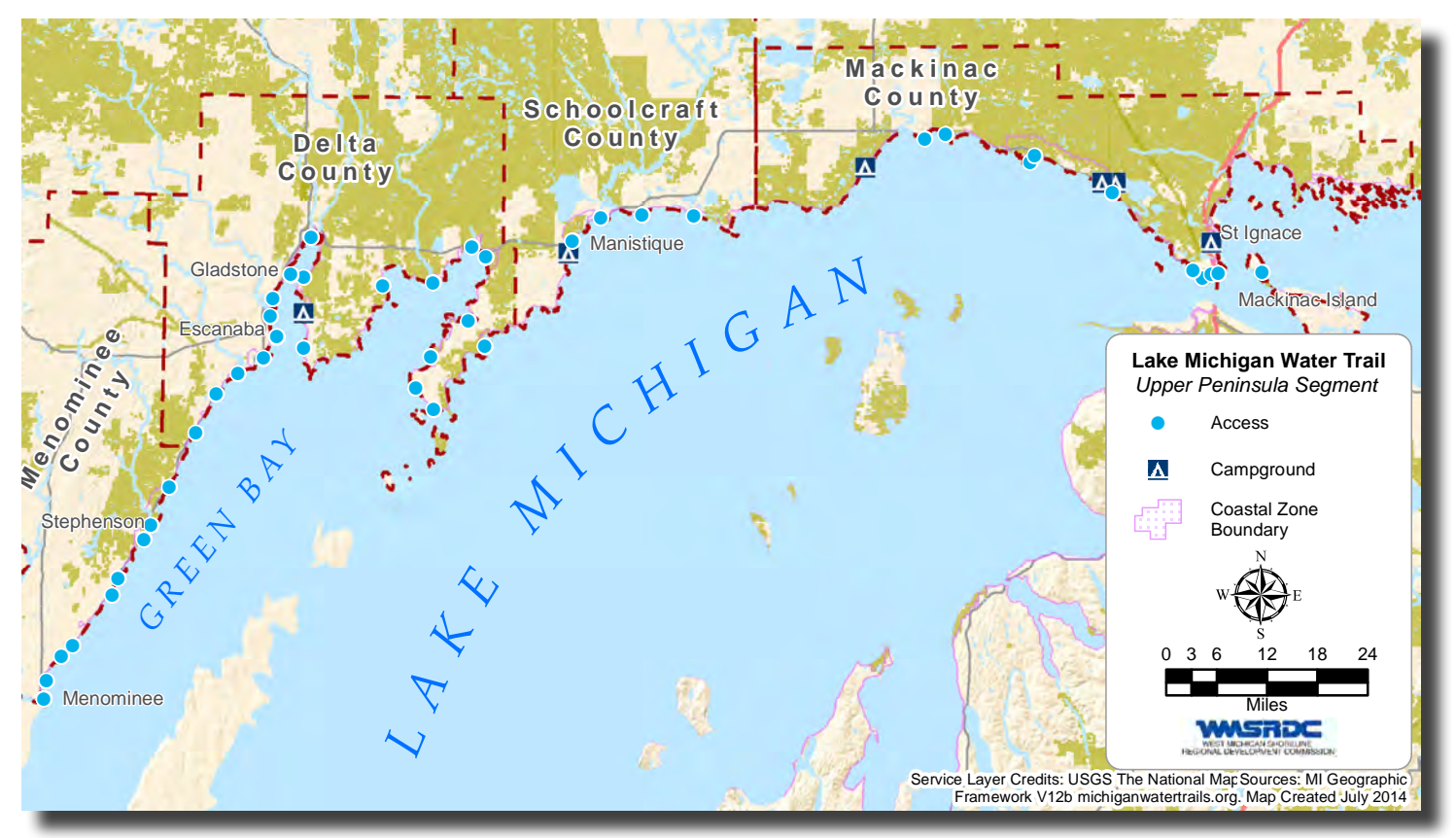
Page 12 Lake Michigan Water Trail