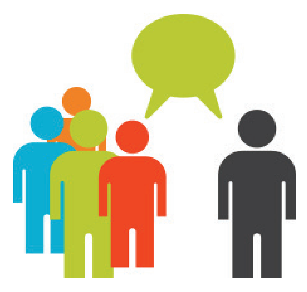
Public Participation Plan - Page 8