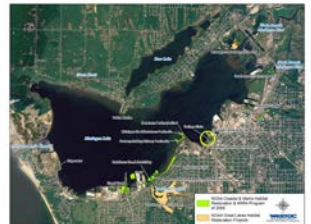
Site Vicinity Map

Legend Move from the Image of the Restoration Footprint to this location