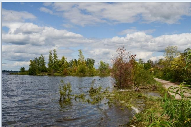
Project site

Within the lower Muskegon River watershed lies the Muskegon Lake AOC , a drowned river mouth lake that flows into Lake Michigan at a shoreline that is part of the world's largest assemblage of freshwater sand dunes. Muskegon Lake was designated an AOC in 1985 due to ecological problems caused by industrial discharges, shoreline alterations and the filling of open water and coastal wetlands.