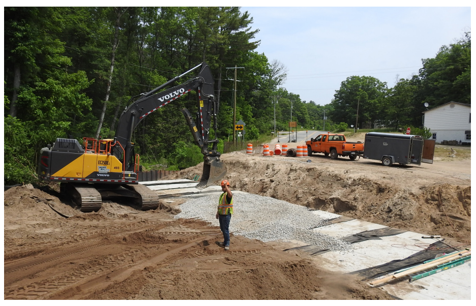
Construction activities at Sweeter Road and Little Cedar Creek crossing on June 6, 2023.

anticipating completing the work at Sweeter Road early summer and following with construction at Michillinda Road later this summer. Once complete, 3.5 miles of cold-water stream will be reconnected with 3.7 miles of warm water habitat, providing fish passage from the headwater lakes to the Muskegon River floodplain.