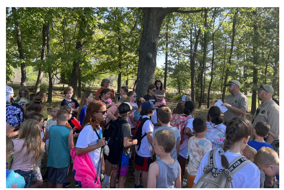
DNR staff providing tree planting instructions to Reeths Puffer students

Additionally, under funds from the DTE Energy Foundation Tree Planting Grant Program, WMSRDC provided 50 trees of differing species to replace the trees that were damaged by high water levels at the Muskegon State Park Channel Campground. This project was initiated by Rebecca Sandee and her Reeths Puffer classroom, who raised funds for student and volunteer transportation, waterbags, tree protection and support materials, mulch, and other related costs. The project culminated on May 31, as roughly 50 students planted all 50 trees under the guidance of DNR staff, Reeths Puffer teachers, and parent volunteers.