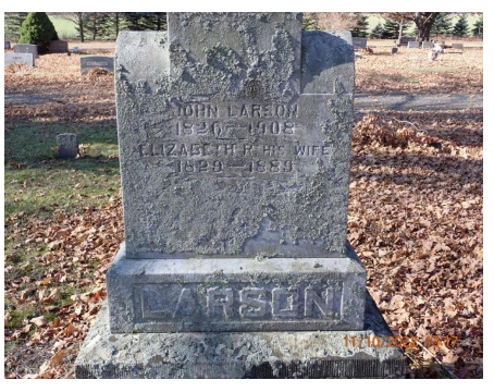
Headstone in Maple Grove Cemetery, Freesoil, MI

For more information about digital cemetery mapping, please contact the WMSRDC GIS department at 231-722-7878, extension 150 or email info@ wmsrdc.org.