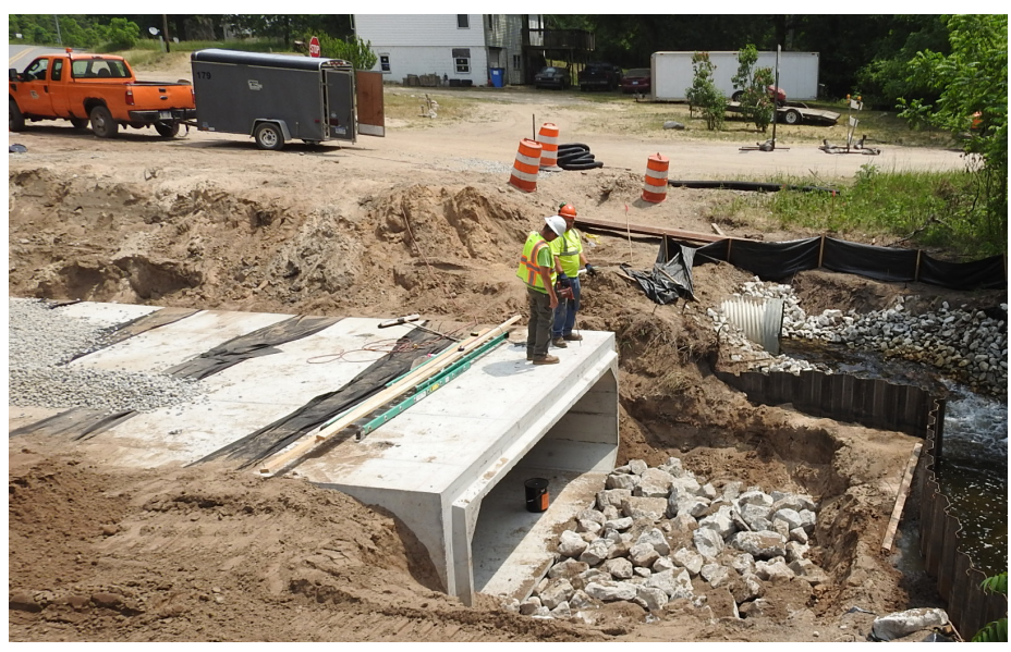
Additional construction activities, at Sweeter Road and Little Cedar Creek crossing on June 6, 2023.