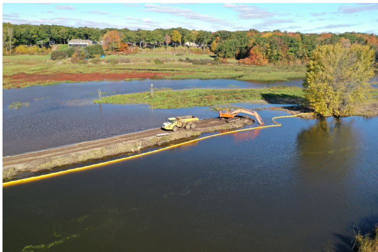
Above right: Opening the channel to LMR (Lower Muskegon River).