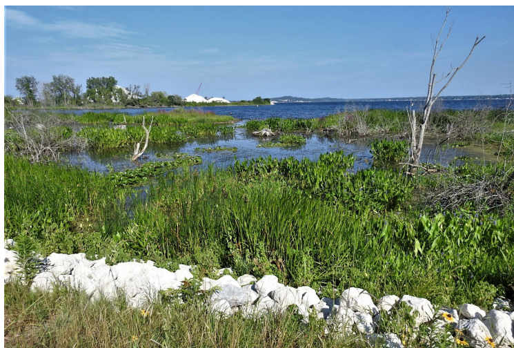
Above left: A photo taken at the AMOCO site along the bike path on the south shore of Muskegon Lake.

These projects will help restore Muskegon Lake to its former place as a major resource for the people of West Michigan and a major asset into the future.