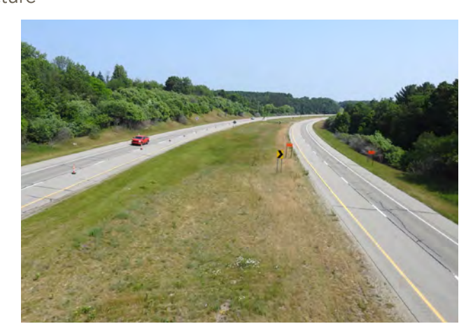
US-31 in Oceana County

In addition to rating the Federal Aid roads, WMSRDC staff will also rate a municipality's local roads on occasion. For fiscal year 2024 WMSRDC received additional funding to rate local roads. Local roads were rated for Muskegon County, northern Ottawa County, and Newaygo County.