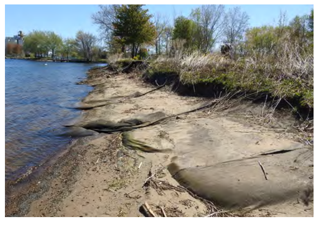
Shoreline conditions prior to the 2024 restoration efforts.

Additional project partners not already mentioned include Muskegon Lake Watershed Partnership and Muskegon County.