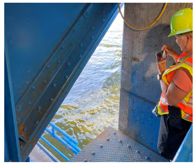
Attendees tour control room of the Grand Haven drawbridge during mobile tour