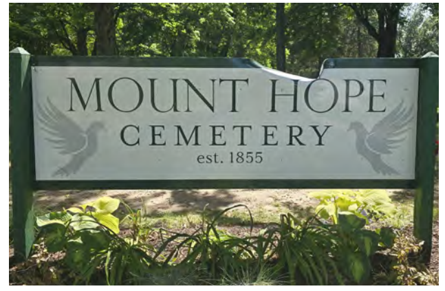
Mount Hope Cemetery, Shelby Township