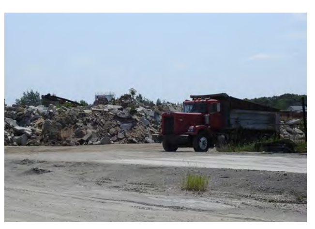
Truck moving debris at Pere Marquette Industrial Park, Mason County

The counties of Lake, Mason, Muskegon, Newaygo, and Oceana have agreed to develop a multi-county Materials Management Plan (MMP) and have designated WMSRDC as their Designated Planning Agency (DPA). In early July, WMSRDC, on behalf of the counties, submitted the required Notices of Intent (NOI) to the Michigan Department of Environment, Great Lakes, and Energy (EGLE). All five of the NOIs have received approval from EGLE. WMSRDC and the five counties are now in the process of appointing the Materials Management Planning Committee (MMPC). The MMPC is expected to be established and begin meeting during the month of October. The MMPC, counties, and WMSRDC then have until January 2025 to develop an EGLE approved MMP Work Plan.