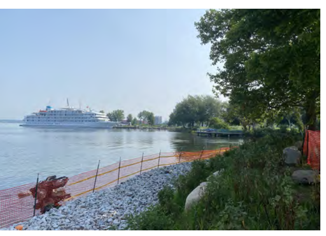
The shoreline conditions nearing the end of construction activities.