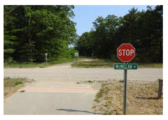
Berry Junction Trail in Muskegon County

It is anticipated that the RFP for planning service will be released this fall with a plan completion date of September 30, 2025.