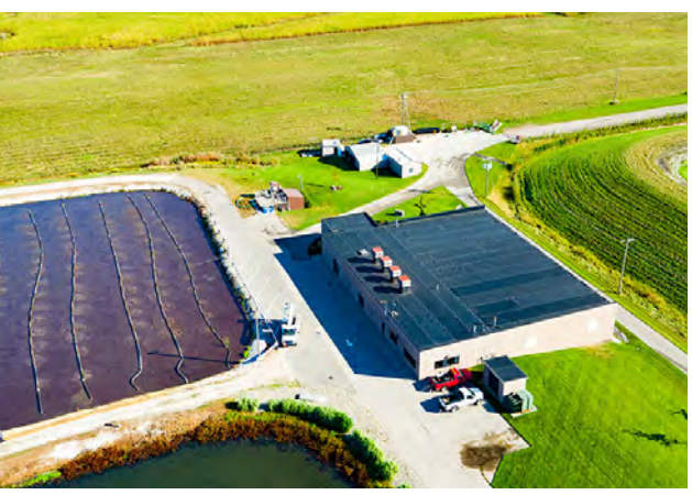
City of Hart BioPure wastewater treatment plant

which may be researched at https://www.eda.gov/funding/funding-opportunities. Please contact WMSRDC early and often to discuss your community's economic development ideas, find the right funding program, and make your application to EDA a success!