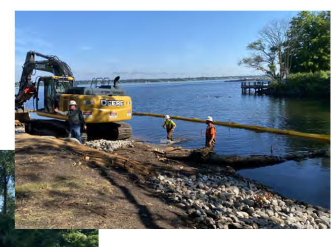
Tree trunks and roots provide basking sites for turtles, resting sites for birds, cover for fish, and help protect the shoreline from wave activity.