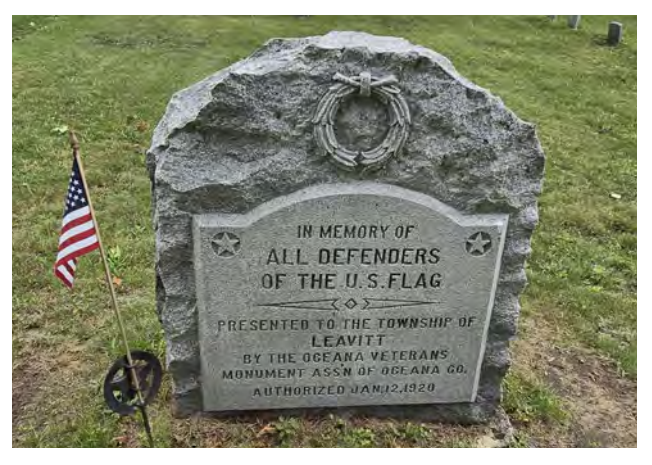
Military monument in Carpenter Cemetery, Leavitt Township