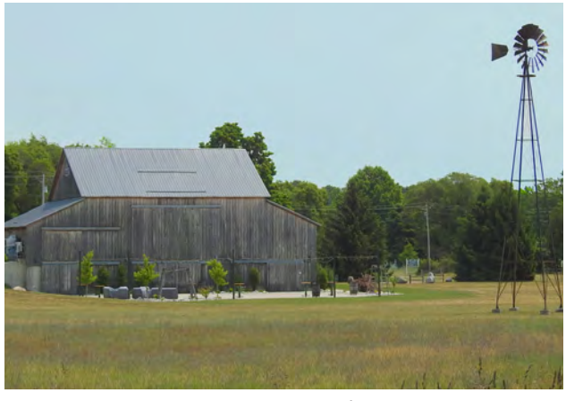
A farmhouse in Oceana County

agricultural economic potential. There are significant growth opportunities in the region's agricultural production, aggregation, processing, distribution, and consumer markets. Enhancing production potential will build on the region's status as a diverse agricultural area, second only to California. Identifying needs for aggregation infrastructure, like storage facilities and food hubs, will support local producers. The region's established food continued on page 2