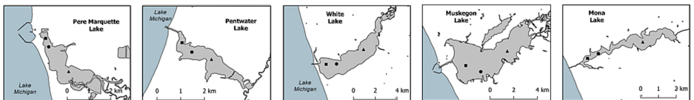
West Michigan Drowned River Mouth Systems: Pere Marquette Lake, Pentwater Lake, White Lake, Muskegon Lake, Mona Lake.