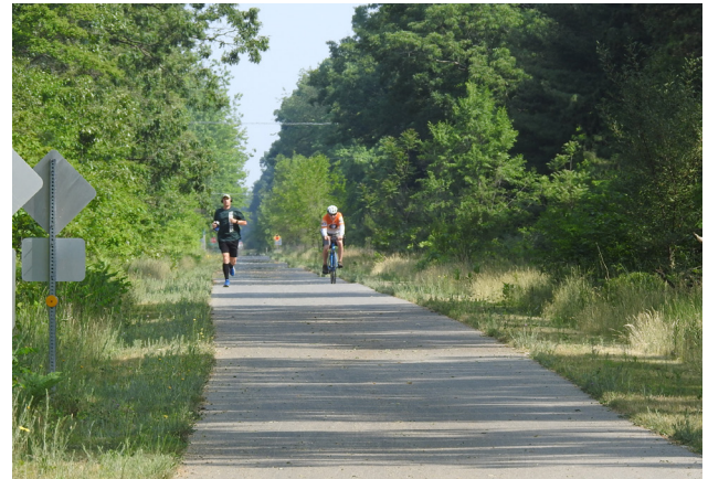
Berry Junction Trail in Muskegon County

This plan will also coordinate with an 18-county regional non-motorized pathway plan being undertaken by the West Michigan Trails and Greenways Coalition. The plan will include a robust public outreach process to educate residents, stakeholders, staff, and policymakers on the best-practice infrastructure and the benefits of this infrastructure. The update will be completed in FY2025.