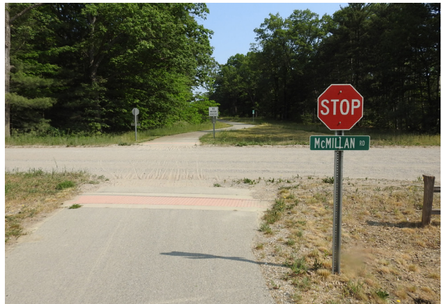
Berry Junction Trail in Muskegon County