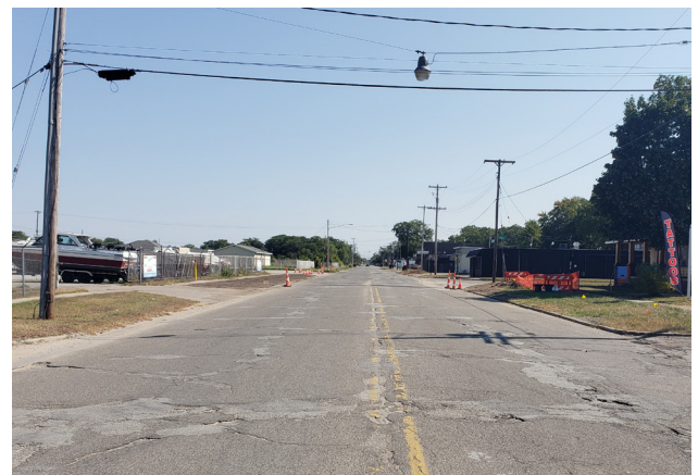
Work began this summer on this stretch of Broadway Avenue in the City of Muskegon Heights.

Commission for a resurface project on Michillinda Road in Fruitland Township. The addition of new projects, or changes that impact the cost or scope of existing projects require an amendment and must follow the MPO public involvement procedures. Minor changes such as typos or minor description changes are allowed to be changed administratively by MPO staff. Any changes to the TIP document are discussed