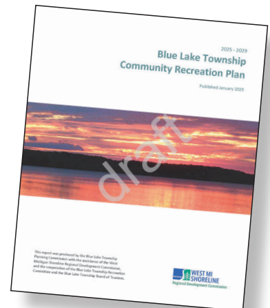
Cover page of the draft recreation plan

Preparation of the MMPs is a new and unique planning process being undertaken in the state. The shift away from Solid Waste Planning to a comprehensive Materials Management Planning process is a practice that has not been done in Michigan. WMSRDC is excited to be partnering with the five counties in our region in navigating this new process together.