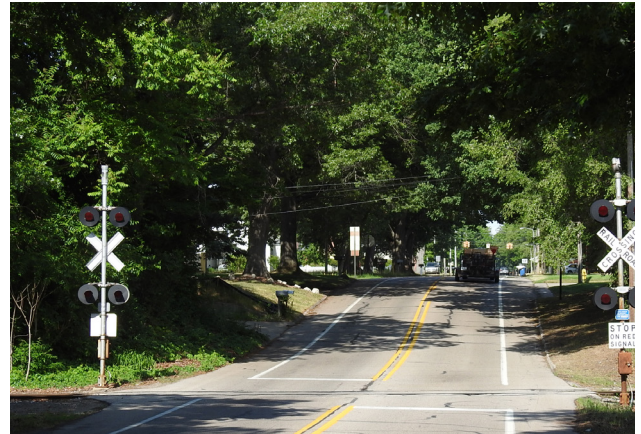
Road Construction in Muskegon County

During the fall of 2024, staff scheduled and held local RTF task force meetings for all five counties in the region to choose projects for fiscal years 2026-2029. After local projects were chosen, the full five county task force met in December to approve the projects.