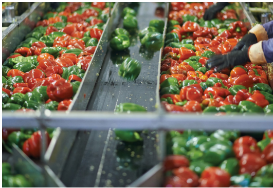
Food processing is an essential component of agriculture in West Michigan

include agriculture sector research and analysis, data mapping, stakeholder engagement, and identification and prioritization of strategic investments and innovative opportunities.