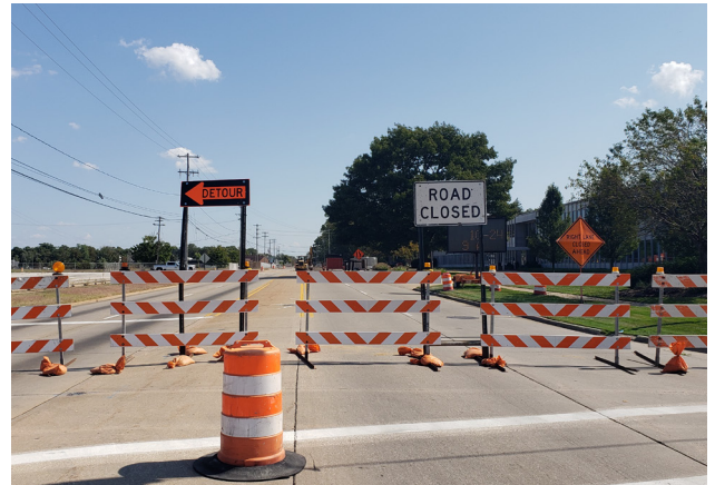
2024 construction project in the City of Muskegon on Laketon Avenue at Seaway, looking east.

WestPlan MPO staff issued a “Call for Projects” in early September to MPO member road and transit agencies. Those agencies submitted prioritized project lists for consideration in the new TIP that is under development. MPO staff hosted a project selection work session on December 5, 2024, to discuss the project submittals and agree on a preliminary draft list to be acted on in January at the MPO meetings. Technical Committee members were able to agree on a draft list and MPO staff are currently working to program the projects into JobNet, the statewide database that houses all federally funded transportation projects. One of the key requirements of this process is that the recommended list is fiscally constrained within the estimated budget for the different funding categories. When the final list is approved, MDOT and WMSRDC will run the projects through several analyses to ensure compliance with federal guidelines. The final FY2026-2029 TIP document is expected to be completed in April of 2025.