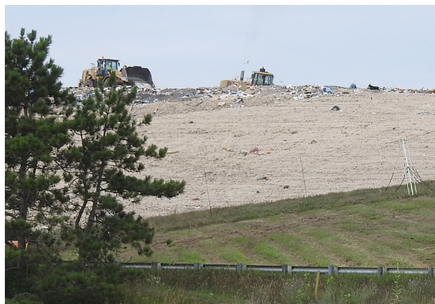
Newaygo Pine Street Access Fill