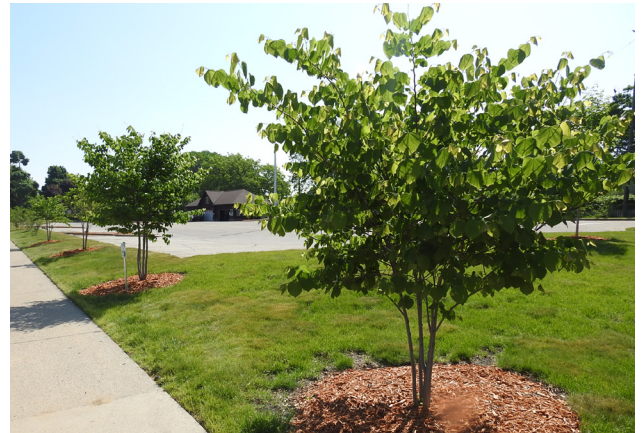
Example of healthy trees within the City of Muskegon

tant will be competitively selected to conduct an unbiased and detailed tree inventory. A corresponding tree management plan will categorize the most dangerous trees in need of removal. Then, with consideration to input provided by underserved community members, the City of Muskegon will implement tree removals and new tree plantings, leading to restored tree canopy resilience with healthy and biodiverse trees. To further engage the youth within the community, Muskegon Community College Forestry Program students will be given