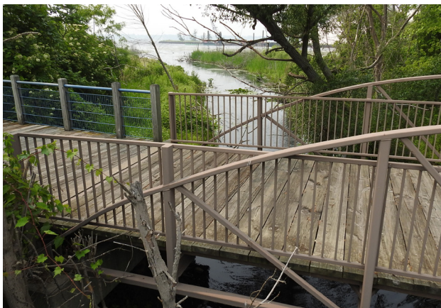
Muskegon Lakeshore Trail