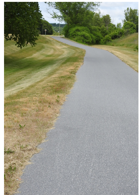
Trail in Oceana County